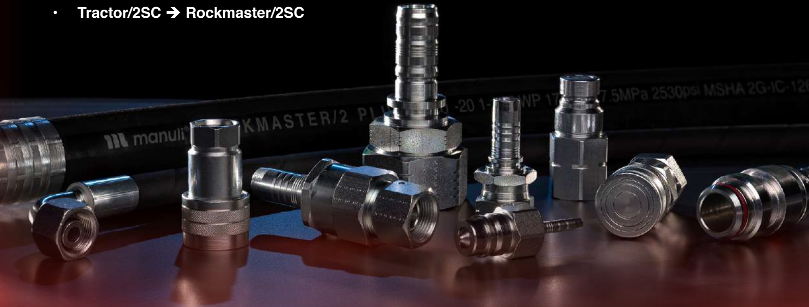
Abrasion Resistance 1